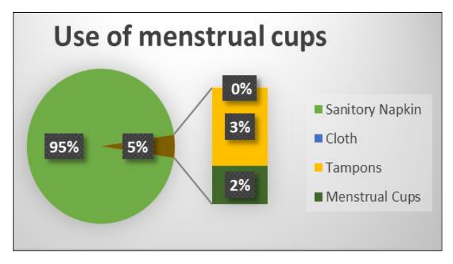
Fig 2: Distribution of participants based on use of sanitary products (n = 191)

Out of the total participants, 103 (49%) are aware about menstrual cups where as 51% were not aware about menstrual cup. Out of 191 participants who attained menarche, 57 (30%) used menstrual cup at least once but are not regularly using menstrual cup. Only 2% are using menstrual cup regularly (Fig 2). The reasons for not using menstrual cups are identified are as not aware about how to use, not comfortable on application, no facilities for emptying, cleaning and reinsertion.